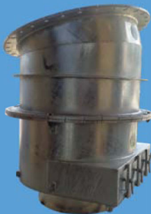
Eco Check Valve