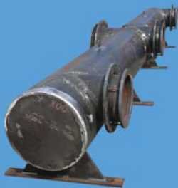
Steel Suction Manifold