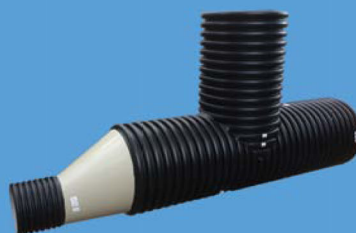
Custom StormPRO Junction