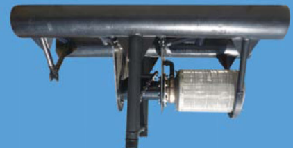
Poly Pontoon with built in Footvalve