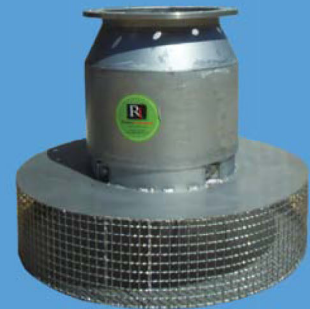
Footvalve with Squat Strainer