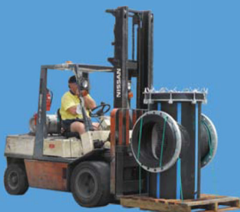
Inline Leaf and Lint Suction Strainer