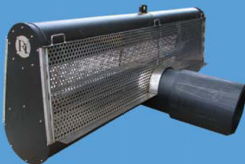
Water Intake Screen