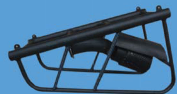
Poly Pontoon with built in Footvalve and Vortex Plate