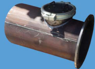
Eccentric Taper with Hatch