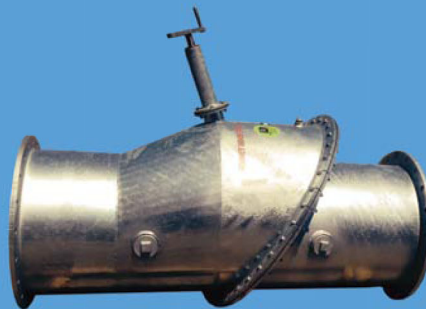
Gate Check Valve