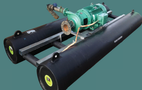
Standard Double Float with Frame