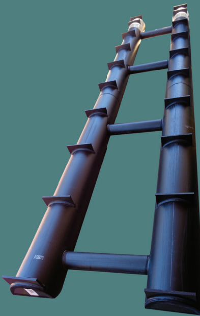
630mm x 10mtr Double Float Fabricated to Drawing Specs