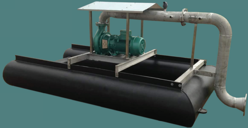
500mm x 3m Double Float