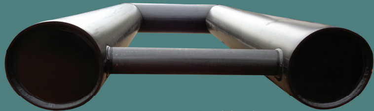
630mm x 4.5m Double Float