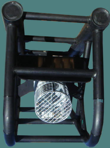
Poly Pontoon with built in Footvalve