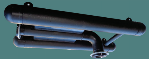
Float Double Heavy Duty 250mm x 2000mm c/w 200mm SDR11 T/D inlet and outlet