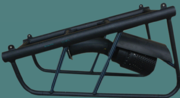
Poly Pontoon with built in Footvalve and Vortex Plate