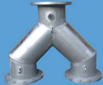
350mm T/E HD Parallel Junction c/w Lift Lug