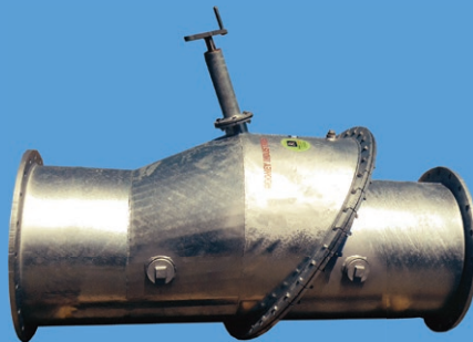
Gate Check Valve