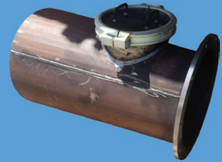
Eccentric Taper with Hatch