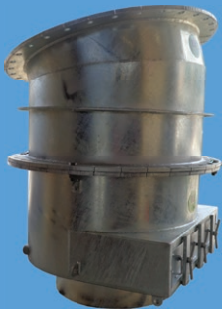
Eco Check Valve