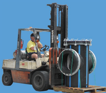
Inline Leaf and Lint Suction Strainer