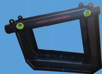
Double Float 200mm x 2000mm C/W Footvalve Protection Cage and Skids