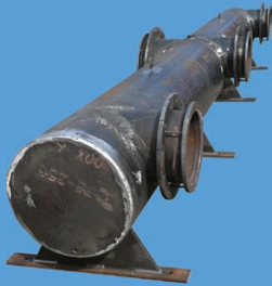
Steel Suction Manifold