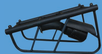
Poly Pontoon with built in Footvalve and Vortex Plate