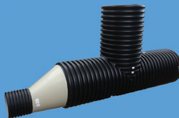
Custom StormPRO Junction