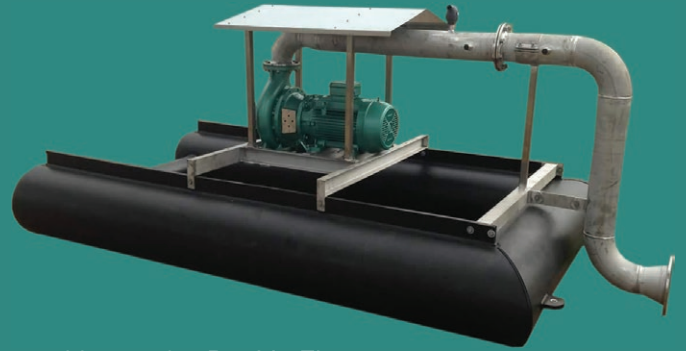
500mm x 3m Double Float