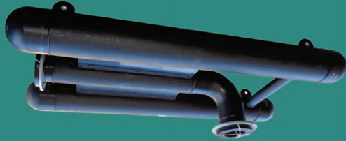
Float Double Heavy Duty 250mm x 2000mm c/w 200mm SDR11 T/D inlet and outlet