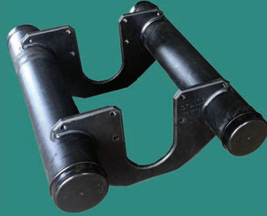
Float Double 160mm x 1200mm c/w 180 Suction Pipe Cradle - Foam Filled