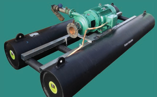
Standard Double Float with Frame