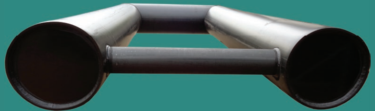
630mm x 4.5m Double Float