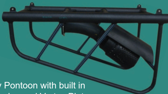
Poly Pontoon with built in Footvalve and Vortex Plate