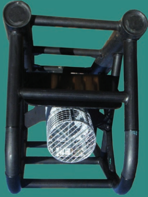
Poly Pontoon with built in Footvalve